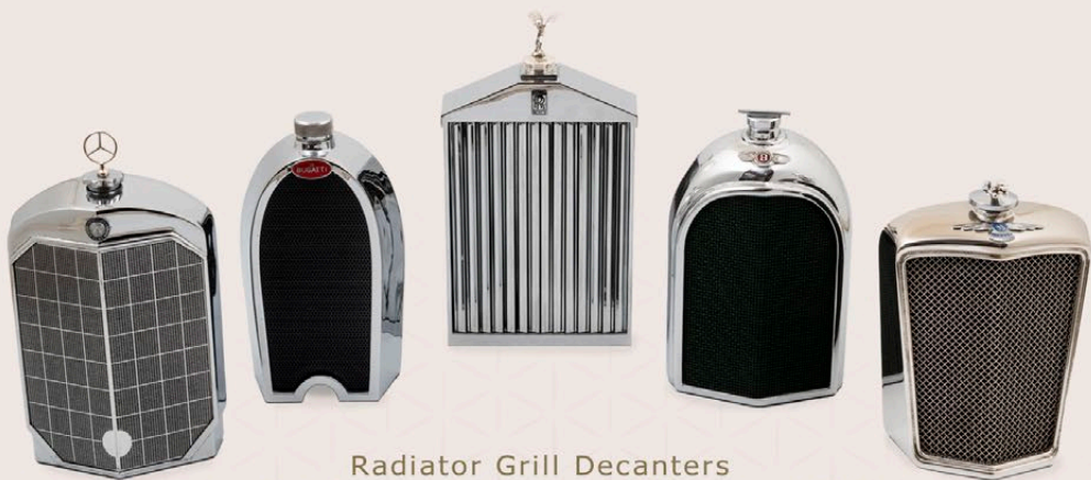
Radiator Grill Decanters by Ruddspeed & Classic Stable circa 1960

If any of these carefully selected pieces are of interest please don't hesitate to get in touch.